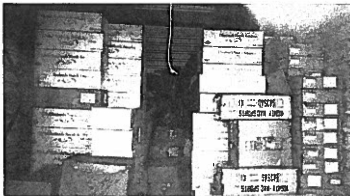
Donated new children's clothes, packed and ready to be distributed to local children's service agencies as well as orphanages and poor children in Viet Nam