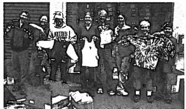
Youth volunteers of the 'Kids Without Borders' project at a recent 'Packing Party'