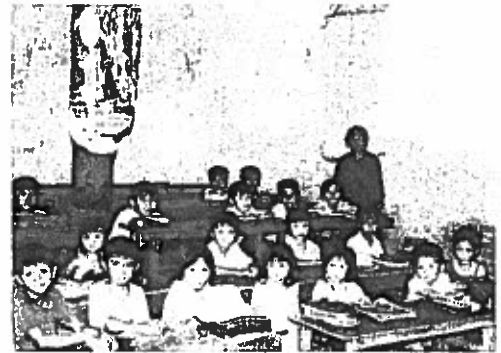
Class inside of 'This Old School' in Nang Ren