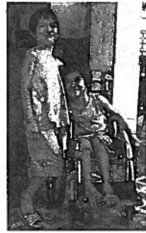
GSVVA has been supported the children of the Go Vap Orphanage through several joint projects with the Club of the University District Seattle